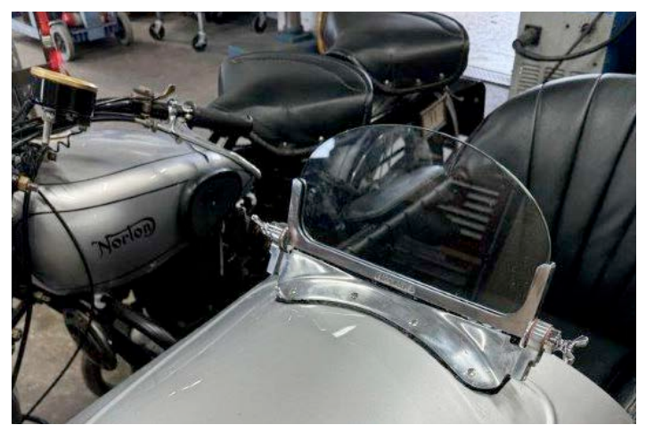
The screen looks perfect on the beautifully restored Melbourne produced sidecar.