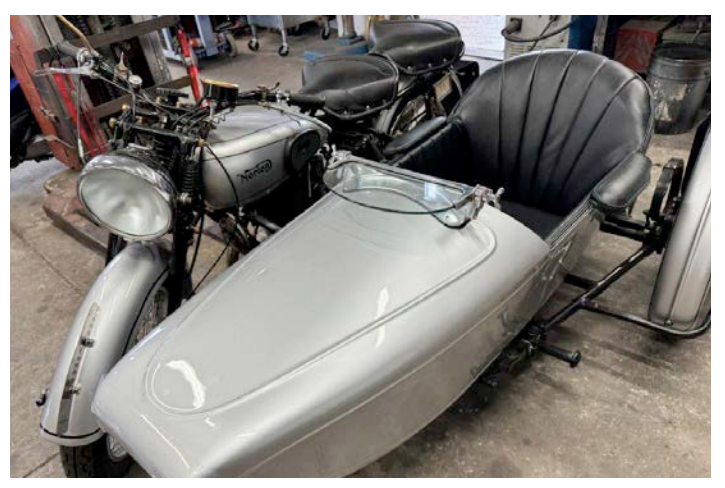
Fitted to a Norton "Big 4" 633cc sidevalve.