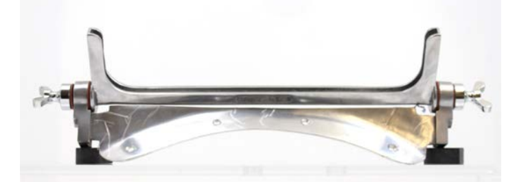
Leaning forward = smaller radius

The radius of the scuttle/plinth casting fits depends upon the angle that the front "flat" lip is sitting at and so is difficult to measure, but means it will work with a range of curves.