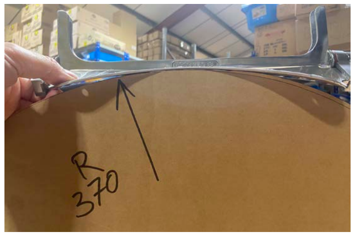
370mm Radius (740mm diameter)

Note with adjustment of angle and use of a thick black foam rubber sealing strip the part will fit a range of different sizes.