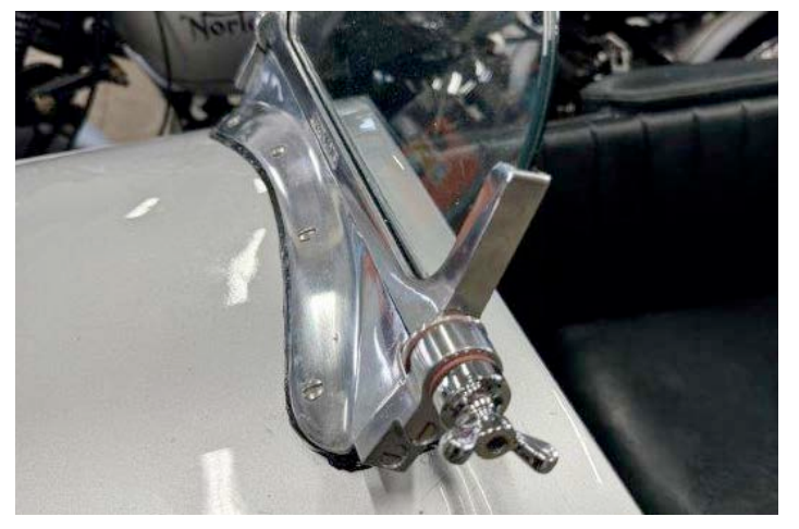
Detail of fitment to the sidecar.