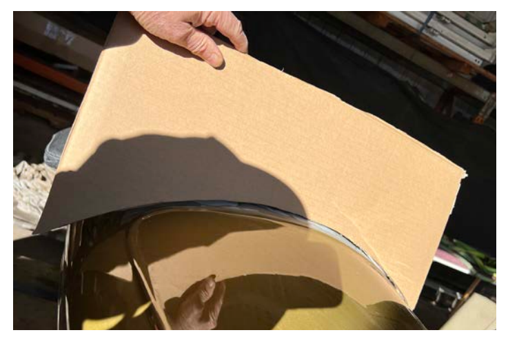
Example1: Trying a 420 mm radius curve onto a "Dusting" sidecar. Thanks to Rod Bowen in Austrailia for the photos.

We will add any fitment examples here when we receive them to help illustrate.